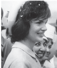
Jackie Kennedy, former First Lady of the United States