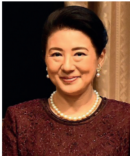
Masako Owada, Empress Consort of Japan